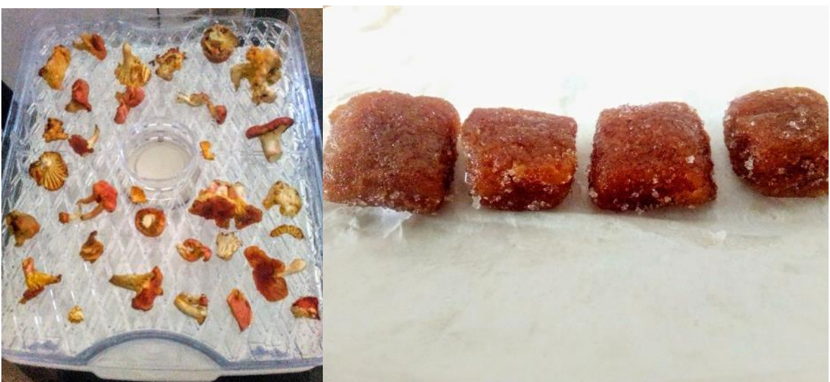
Figure 3: chanterelle mushrooms being test dried in dehdrator (left) and fruit squares made from Garcinia buchananii fruits (right)

Kate also conducted some small informal trials in a range of indigenous fruit and mushroom value addition when they were in season in December (see figure 3), although the target species were not yet known (summarized in the attached Value Addition Trials document – annex 12). A small food dehydrator has also been provided to MMCT for further potential product testing.